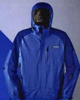
BIONIC COAT [PAGE 25]